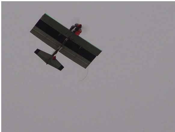
a "bombing pass"