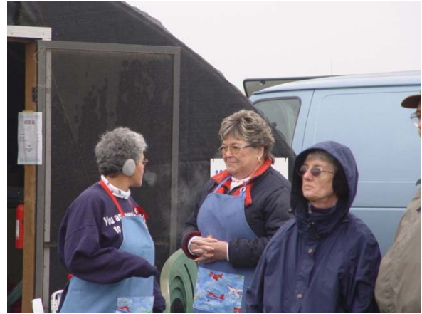
Taking a break from the concession tent to watch all the exciting action