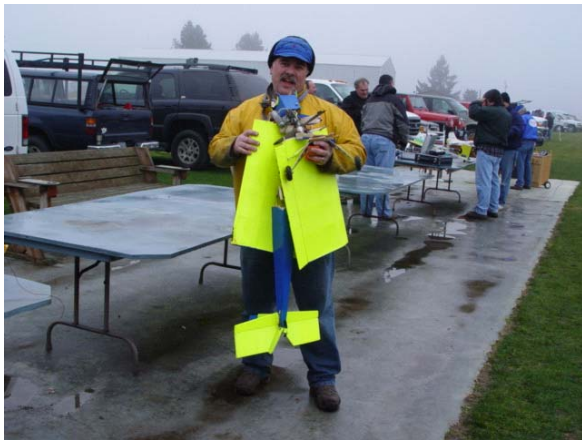
the editor with his Whats It

Here are some shots from Pearl Harbor Day