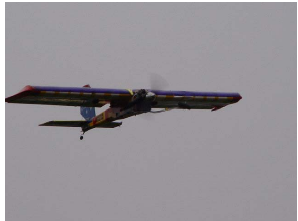
This Magic was a hand launch candidate

Here are some shots from Pearl Harbor Day