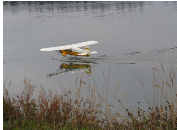
Lookin' good, real good