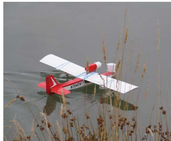
Headed out for the bean drop contest