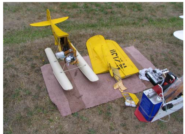
Requiem for a true classic