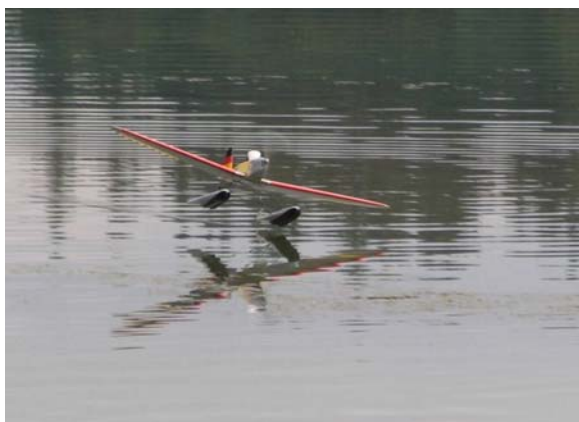
A touch is a touch. Nobody said both floats had to be down at the same time.