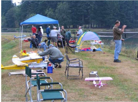
The preparatory donut huddle in progress