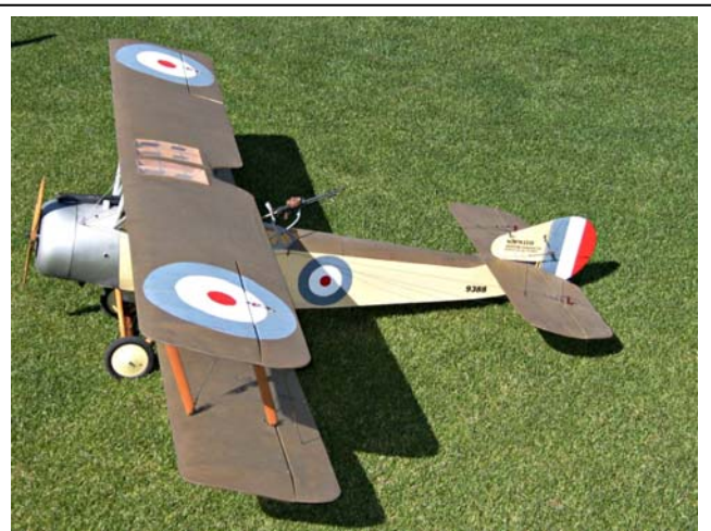
Bob's Sopwith 1 1/2 Struter on the review line