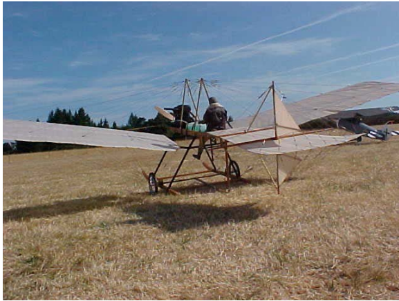
Joe Topper's new Fokker Spin prototype.