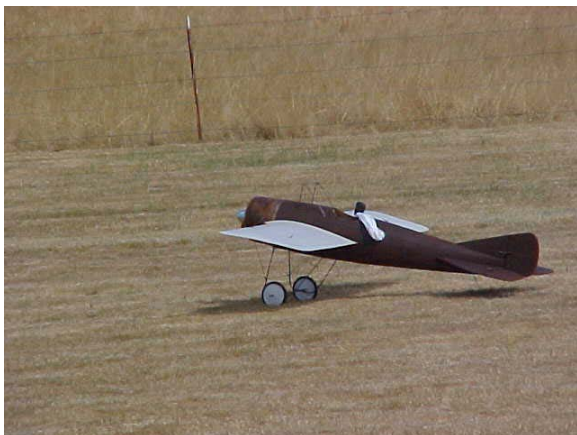
Gene LaFond off to the races.