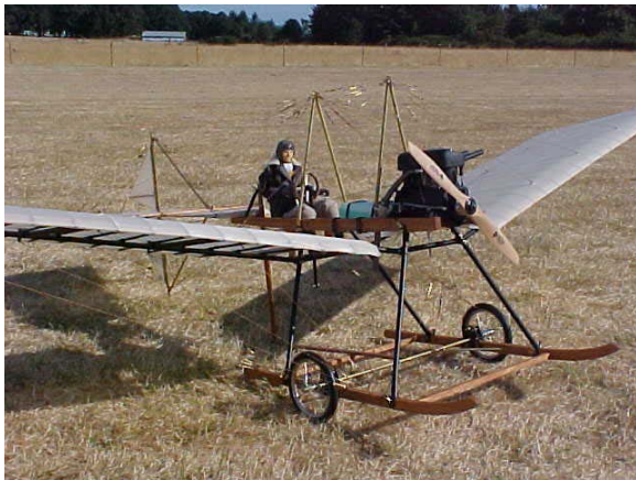
Front view – look at that dummy engine hiding a Lazer 180.