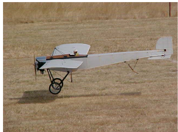
Bruce's touchdown after a successful race.