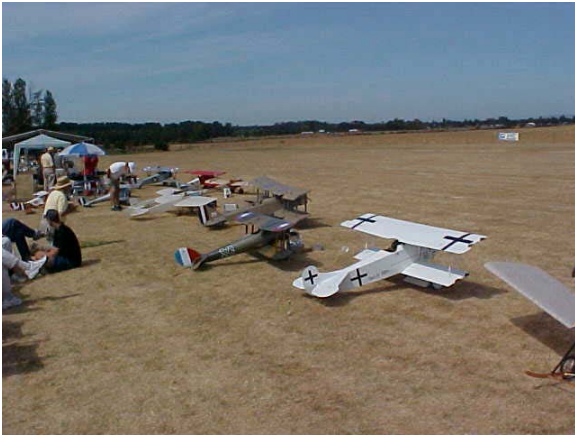
A gaggle of WWI aircraft waiting for the next sortie.