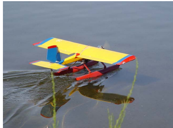
Magic on the water

Visa/Mastercard 10807 SE Stacy Ct. • Portland, OR 97266