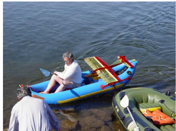
Dale paddled some planes back too