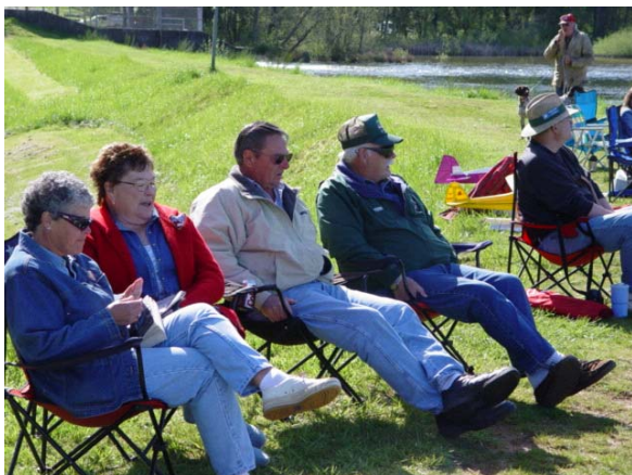
there was plenty to watch when not flying

Flight Line is published monthly by SkyKnights for its members. Articles, letters and ideas for publication should be sent to the editor at 3925 S.E. 136 th , Portland, OR 97236 no later than the first Monday of the month of publication. Feel free to call in information at 503-761-3109 or email to dalemcdonald@comcast.net