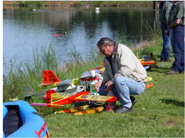
Bob Hoover gets his winning plane ready