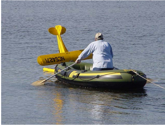
the "Weave" rowing out to retrieve the big Cub