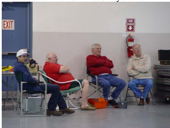
some of the indoor regulars taking a break to watch the action