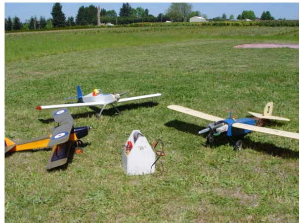
Here are some shots that your newsletter editor took, when he wasn't shooting either the breeze or tough and go's