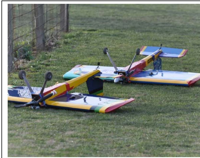
How to make the airplanes stay on the site