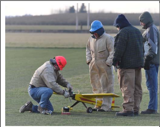
How many Sky Knights does it take to...?