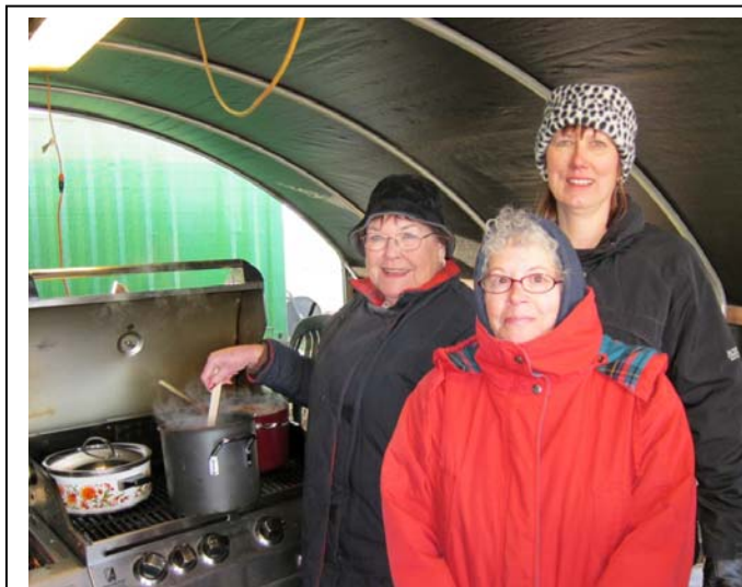
The most popular people at the event