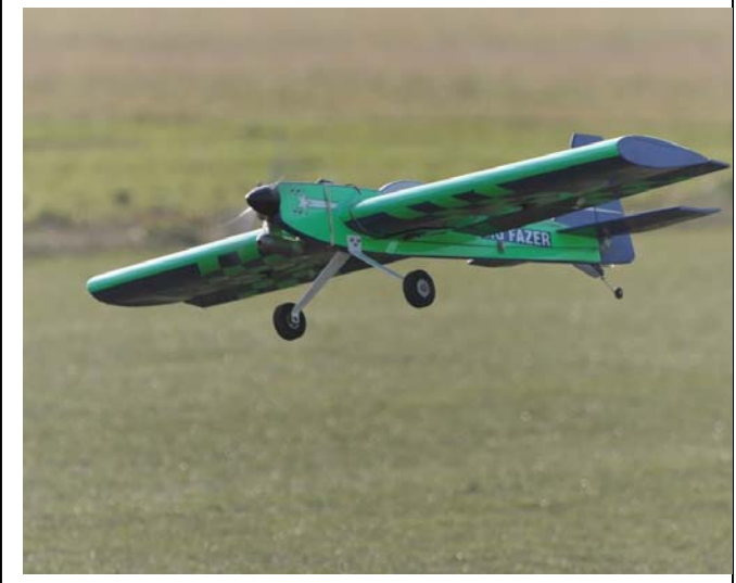
Joe Topper's Fazer headed up-wind