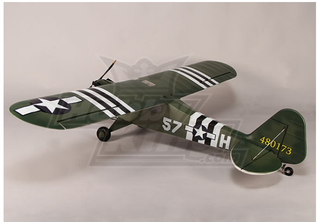
1400 MM Grasshopper

Well, ignoring the fact that it has nice semi-scale landing gear, wouldn't you want to do these two steps in the opposite direction? I generally do. :-)