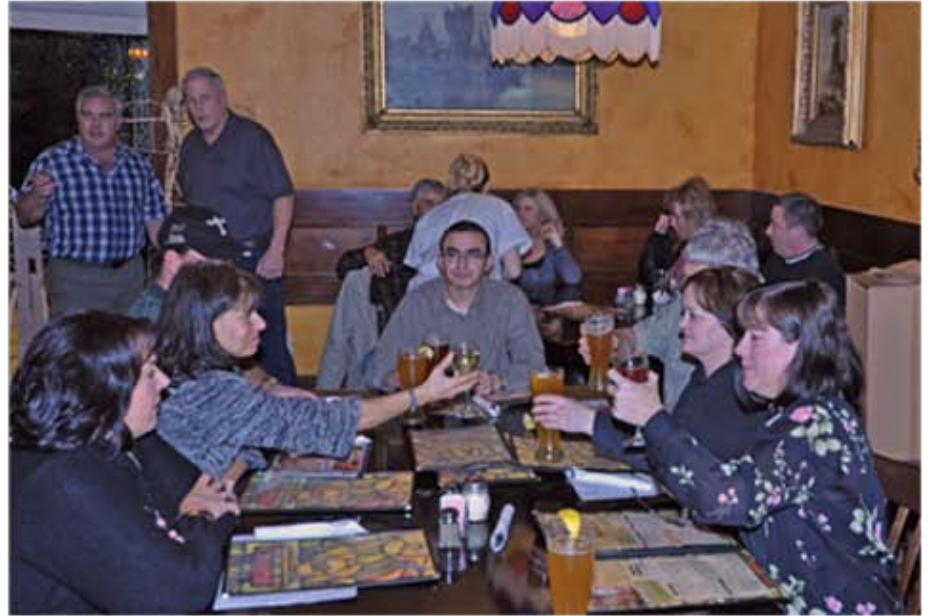
It was a big happy crowd of over 65 people.