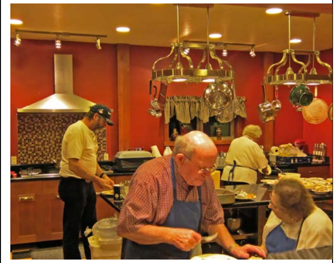
The Sandy Grange crew that fed us so well