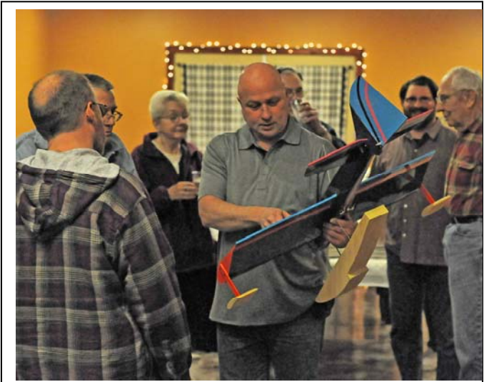
Some of the folks at the banquet and an airplane