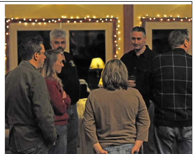
A few more of the banquet goes