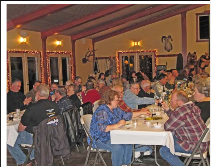
Another view of the turn out for the banquet