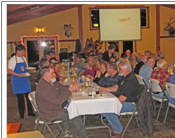
People enjoying an excellent meal